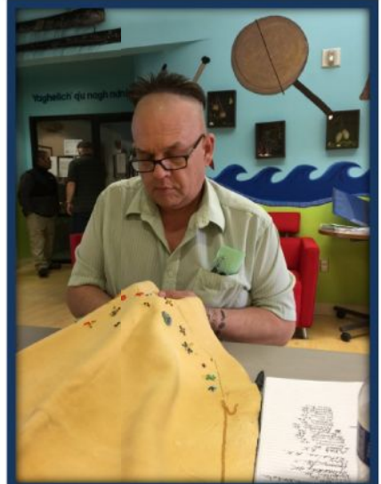
Head Start Director