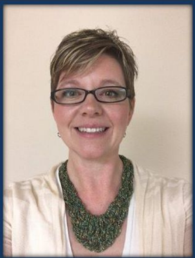
Administrative Support Staff