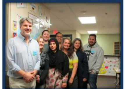
Program Policy Council