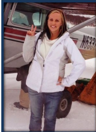
Content Area Specialist