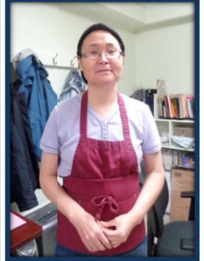
Cook of the Year