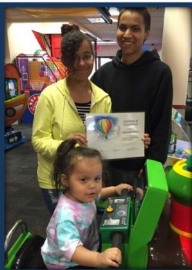
Beating the Odds