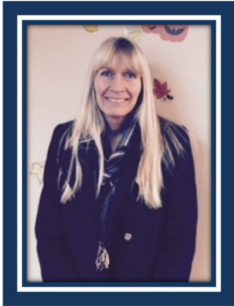
Mother of the Year