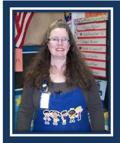
Teacher of the Year