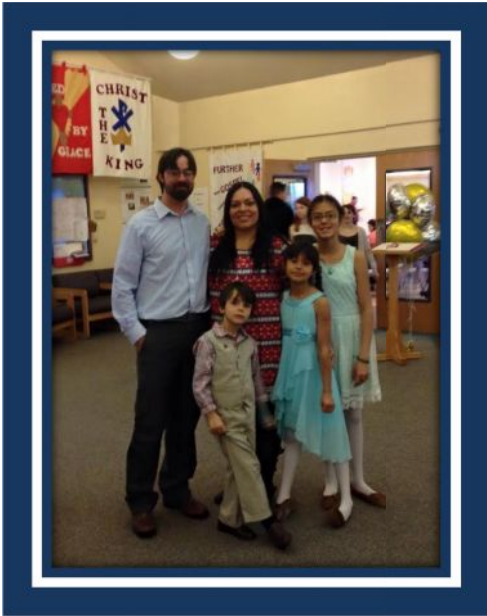
Father of the Year